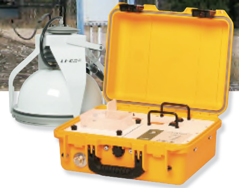
LI-COR LI-8100 Soil CO 2 Flux Analyzer with 20 cm Chamber

It is rare that a day goes by when we're not presented with more concerns of the effects on global climate change due to increased greenhouse gas emissions. While experts may not always agree on the solution, most agree that technology-based solutions should be evaluated and ready should they need to be implemented. One technology, of a diverse portfolio of options, is Carbon Capture and Storage (CCS), also known as carbon sequestration. Most efforts involving CCS focus on the capture of CO 2 from large-scale stationary sources with storage in deep geologic formations (i.e., depleted oil and gas fields, saline formations, and unmineable coal seams), or terrestrial sequestration (i.e., trees, soil, etc.).